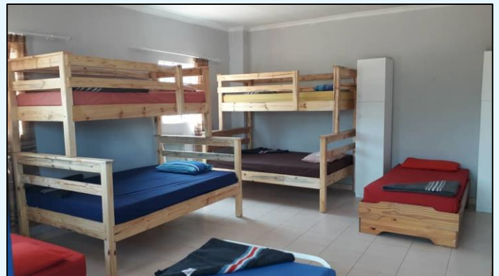
Girls' dormitory

This is a tremendous achievement, made possible by the material and prayerful support of our valued donors and volunteers. Your contributions helped this dream become reality! Thank you for being an important part of this transformative process that is bringing such joy to the people of Drimiopsis and their most needy little ones!